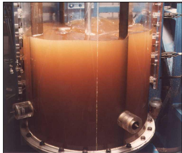
Physical model study of a high viscosity mixing application

BHR Group is a world centre of fluid mixing expertise and know-how in the design, optimisation and scale up of chemical reactors for single-phase and multiphase processes.