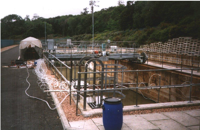
The group performs tracer testing at both water and waste-water treatment plants